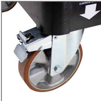
Easy to manoeuvre via heavy-duty castors with non-marking tyres

hospitals, schools, airports, shopping centres, retail outlets, transport environments, factories, offices and on construction sites.