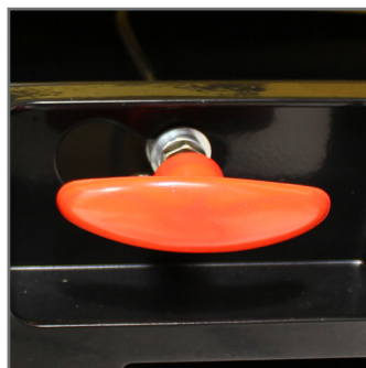
Easy access to single stage emergency descent