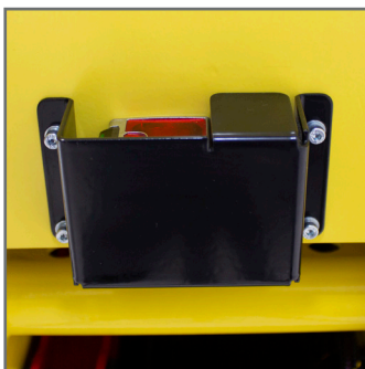
Overhead obstruction detection with alarm frequency increase and interlock