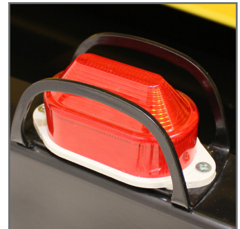
Warning lights and alarm on ascent/descent