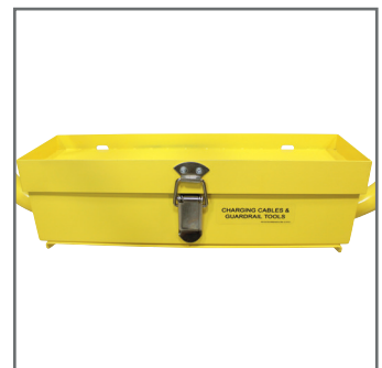
Toolbox containing charging cables and guardrail tools with tray mounted on guardrail