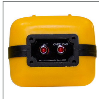
Tilt and overload warning lights, alarm, and interlocks