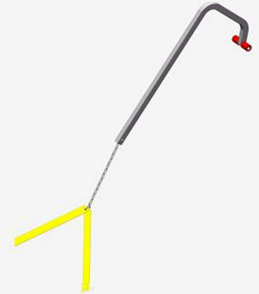
Roof Hook with Steel Chain